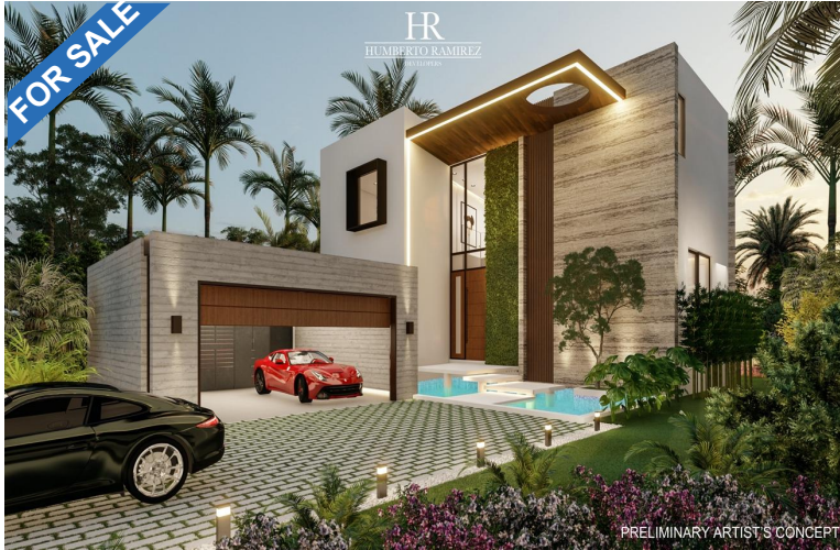
3172 NORTH BAY RD, MIAMI BEACH.