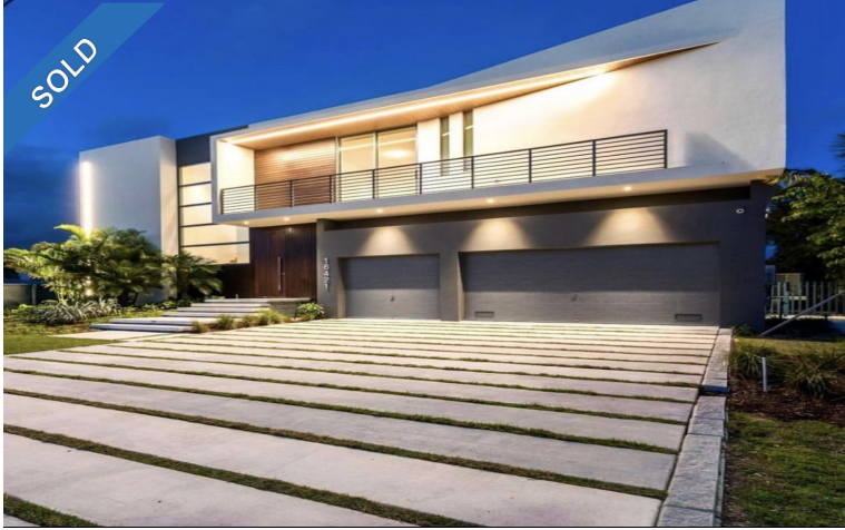
16421 NE 30TH AVE. NORTH MIAMI BEACH