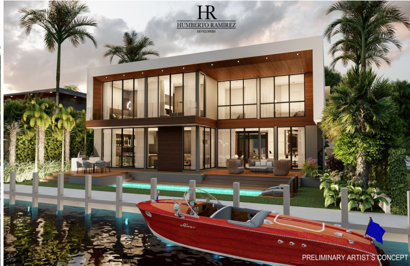
3508 SEGOVIA ST, CORAL GABLES