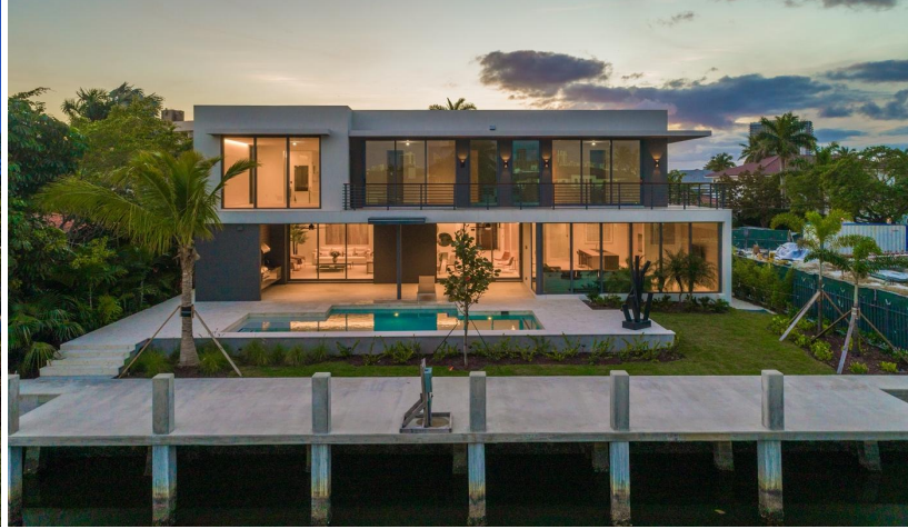
16429 NE 30TH AVE. NORTH MIAMI BEACH