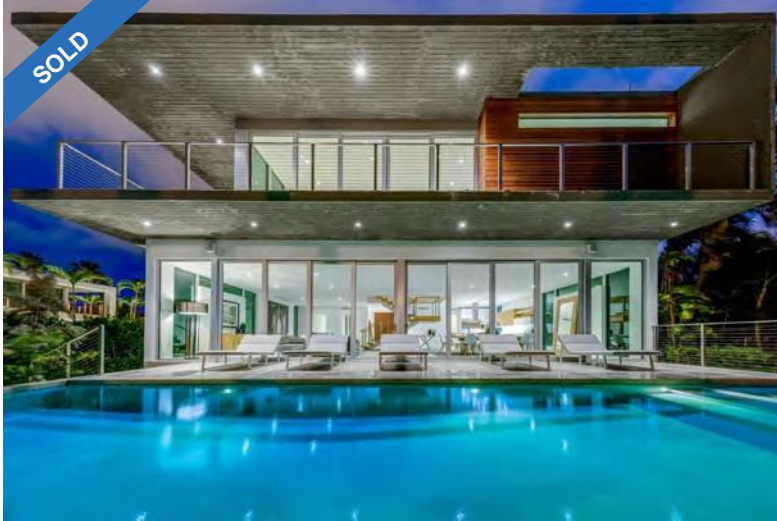
201 PALM ISLAND, MIAMI BEACH