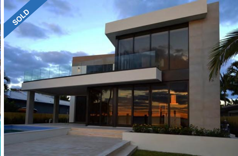
2430 N SHORE TC, NORMANDY ISLAND, MIAMI BEACH