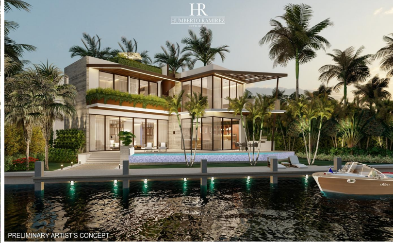
3130 & 3132 PLAZA STREET COCONUT GROVE