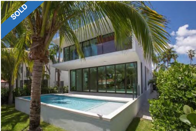
247 PALM ISLAND, MIAMI BEACH