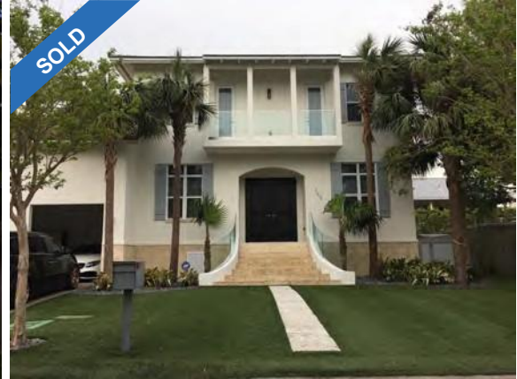
345 WESTWOOD, KEY BISCAYNE