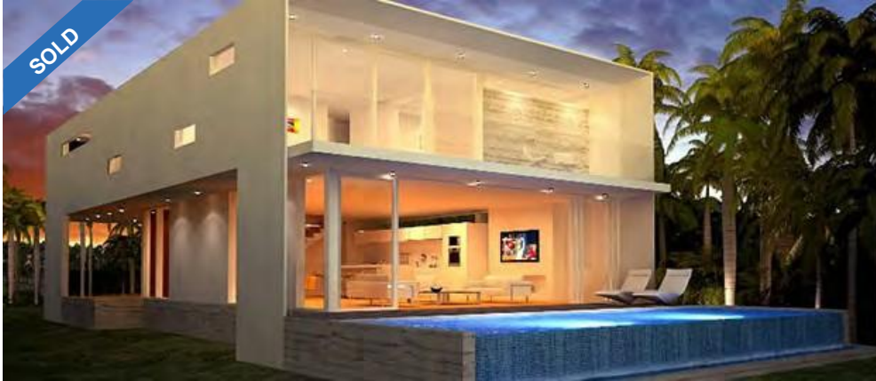
271 COCONUT LANE, MIAMI BEACH